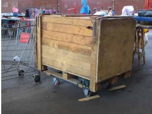
Typical storage box