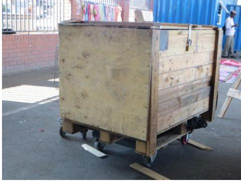
Typical storage box

Application of hinged components to form spatial separation of exclusive care functions e.g. hygiene, sickbay and food preparation